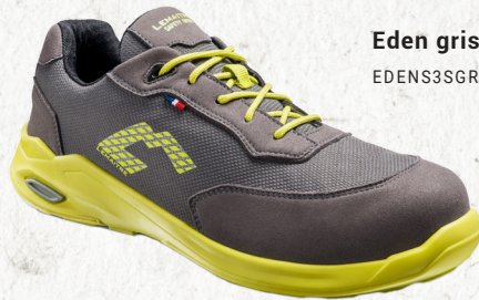
Eden gris S3S EDENS3SGR